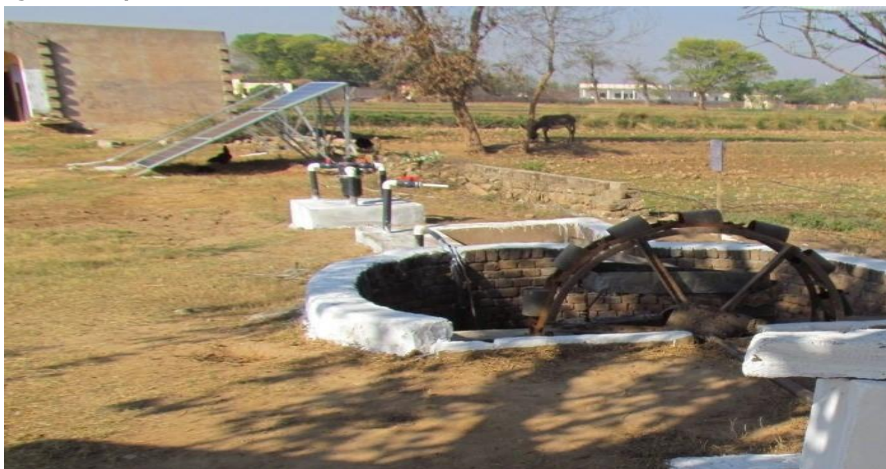
Figure 2: Replacement of Persian Wheel with SDPs

The actual cost of a solar-driven pump (SDPs) is 100,000 PKR, and the cost of drip irrigation per acre is 275,000 PKR on average ( Frequently Asked Questions | On Farm Water Management , n.d.). The total cost of a SDDIS is 375,000 PKR. However, after a 75% subsidy from the Punjab government Subsidies for Farmers | On Farm Water Management (n.d.), the cost of a SDDIS was reduced to approximately 94,000 PKR. Farmers were offered the option to purchase a SDPs pump for 25,000 PKR without drip irrigation and a SDDIS for 8 kanals for 94,000 PKR with subsidies. The farmers' responses were recorded as "1" for "willing to adopt" and "0" for "unwilling to adopt." Products 1 and 2 were SDPs and SDDIS, respectively, and their willingness to adopt each was recorded in the survey. Classical linear models, such as ordinary least squares (OLS), may