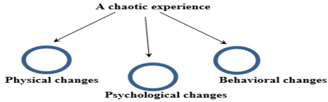
Figure 2: The Core theme with three Sub-themes (Theme 2. A Chaotic Experience)