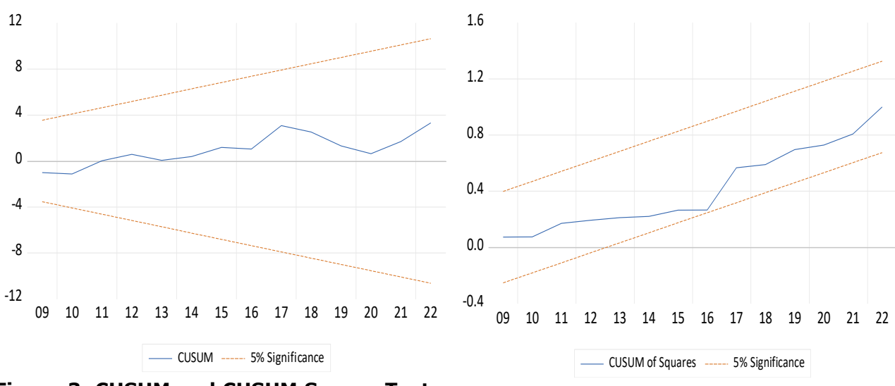
Figure 3: CUSUM and CUSUM Square Test

CUSUM and CUSUMS of squares also show that the values of estimated parameters are stable as they have not gone outside the critical lines. Thus, the plotted deviations and plotted square of deviations show model is stable.